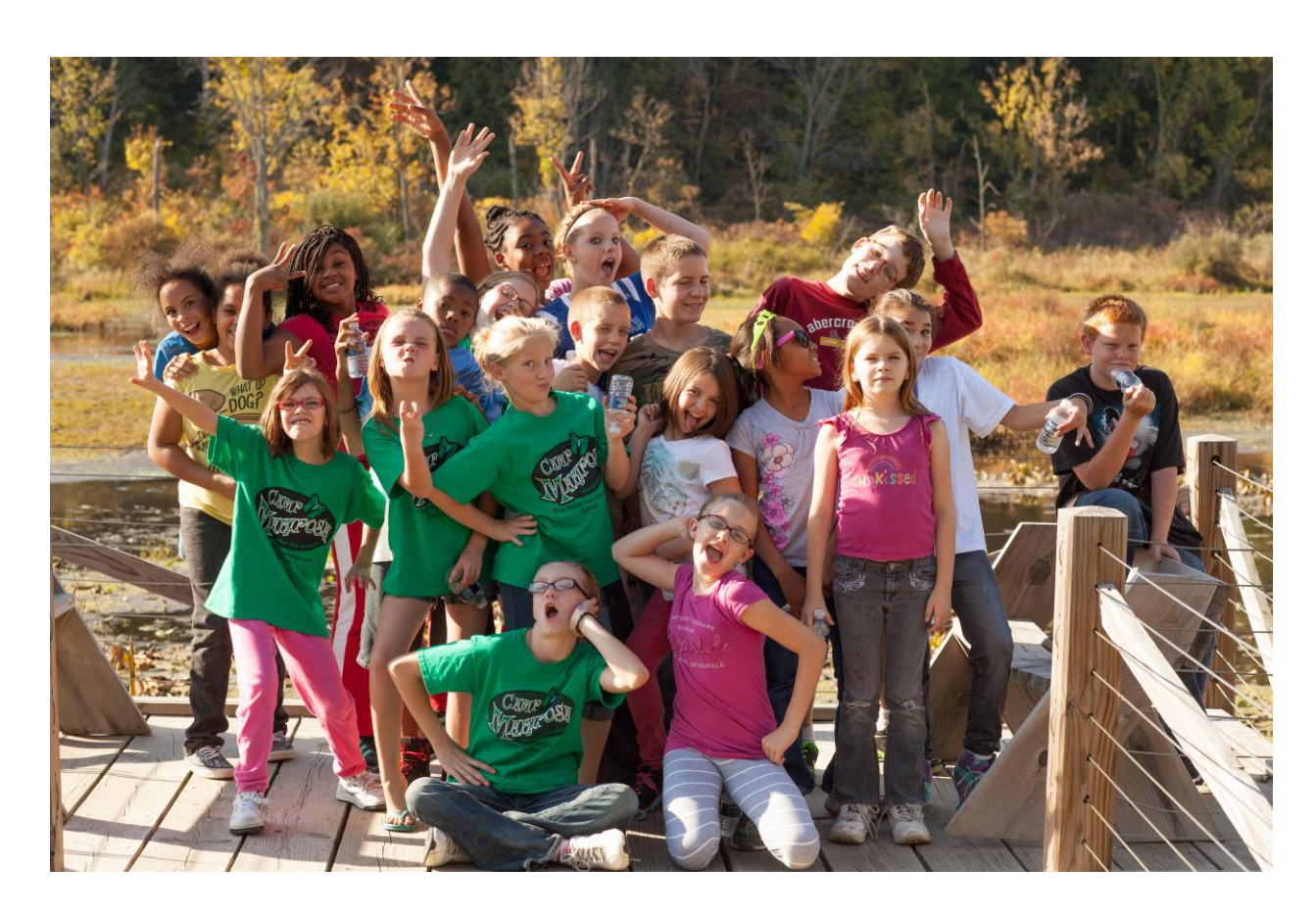
Camp Mariposa creates a fun, safe environment for campers to talk about the addiction in their family without fear of being judged.