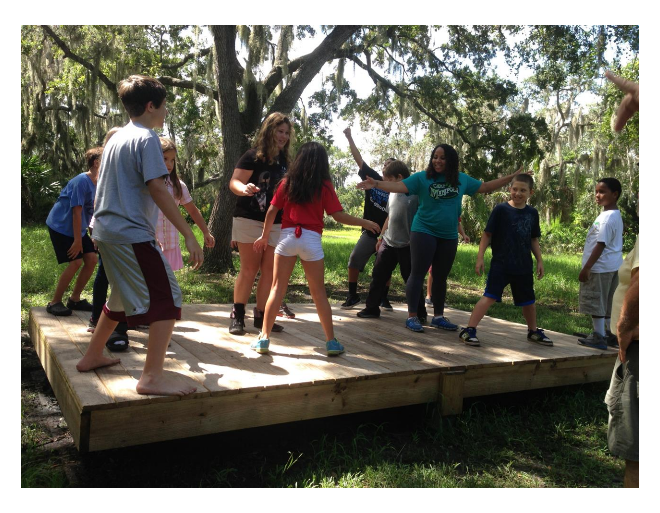
Many Camp Mariposa locations offer challenge course activities to create opportunities for confidence-building and peer-bonding.