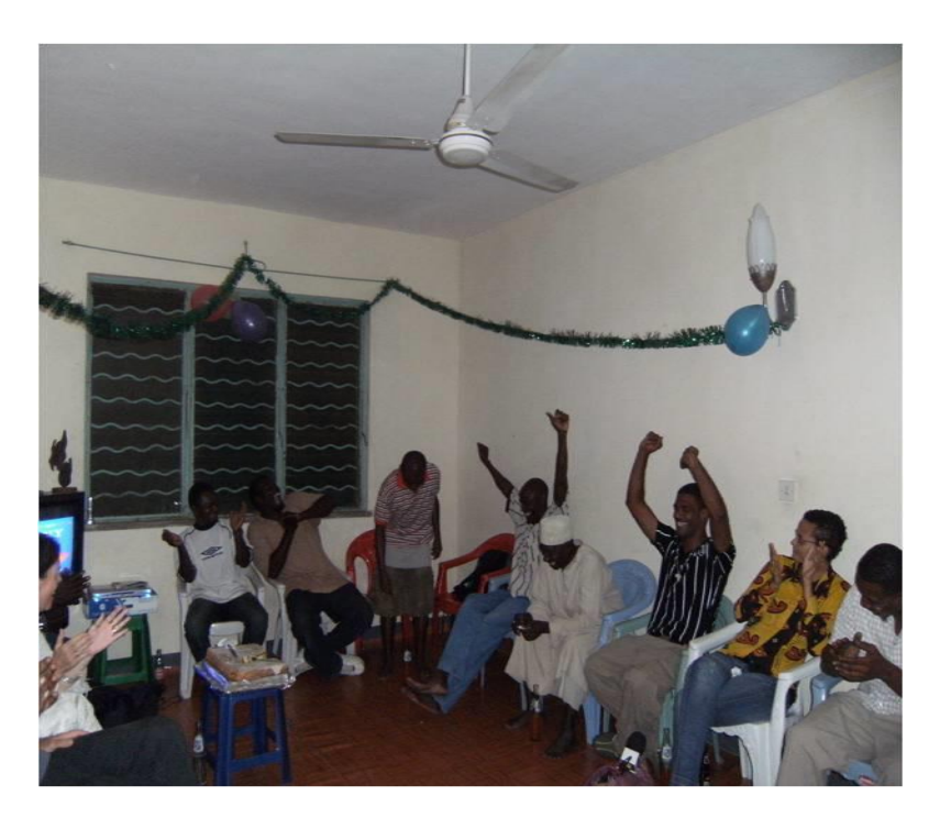
Recovery Celebration Event