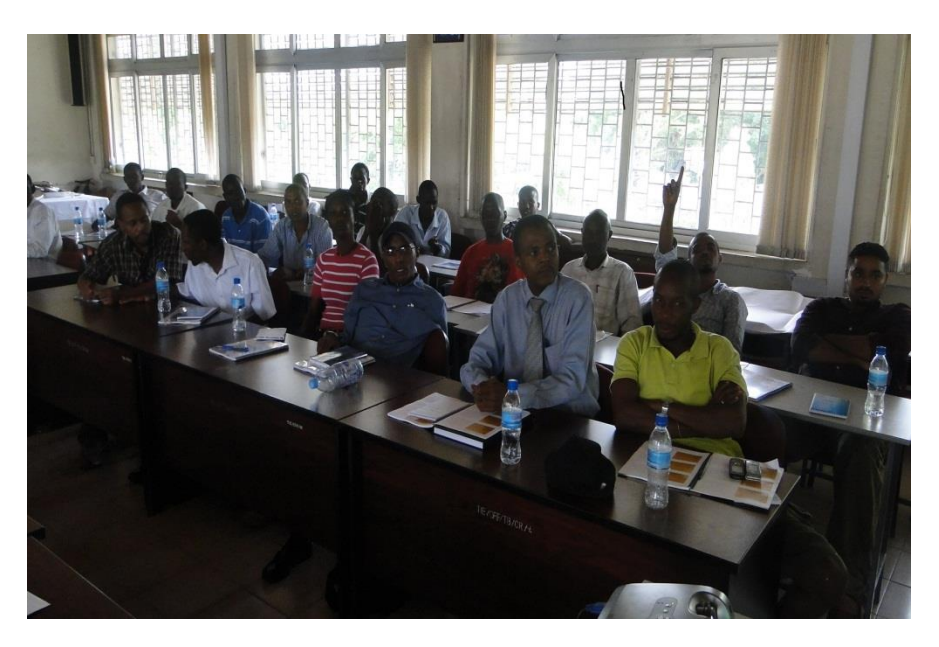
Recovery Coach Trainees