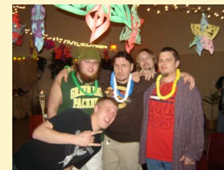
Luau attendees enjoyed an evening packed full of food, fun and fellowship!

Chestnut Health Systems 1003 Martin Luther King Drive Bloomington, IL 61701 (309) 827-6026 www.chestnut.org/alumni