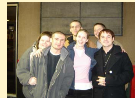
Alumni and individuals in recovery enjoyed 2 games of bowling at the bowling night

Chestnut Health Systems 1003 Martin Luther King Drive Bloomington, IL 61701 (309) 827-6026 www.chestnut.org/alumni