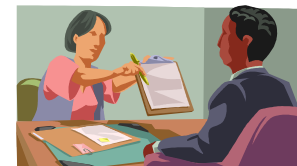
The kind of treatment needed will be assessed carefully and accurately.

that may be required. The level of intensity of care is based on guidelines developed by physician members of the American Society of Addiction Medicine 12 (ASAM) that are used by treatment providers throughout the United States.