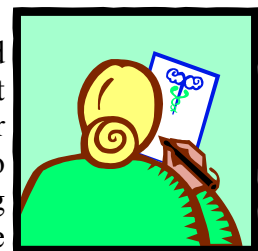
Most individuals qualify for financial assistance.

nearly all the costs incurred during treatment. The most common other cost is for urine tests that are used to test for substance use during treatment. Some insurance providers do not cover the costs of these tests. Medical costs such as from injuries or for medication may not be covered. Our financial staff will work with you and your insurance provider to see if services for your son or daughter can be covered by various public funds and grants that support treatment services at CHS.