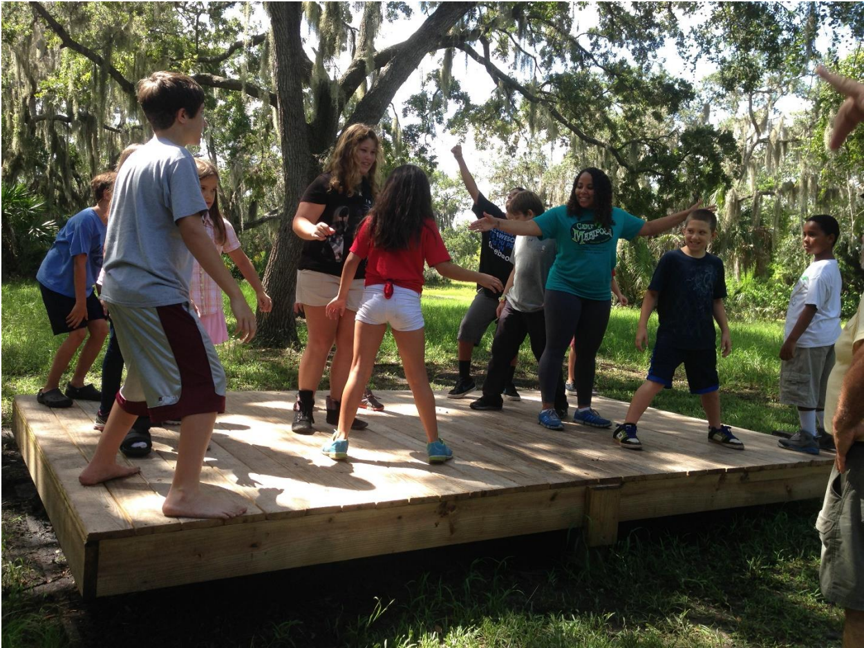
Many Camp Mariposa locations offer challenge course activities to create opportunities for confidence-building and peer-bonding.