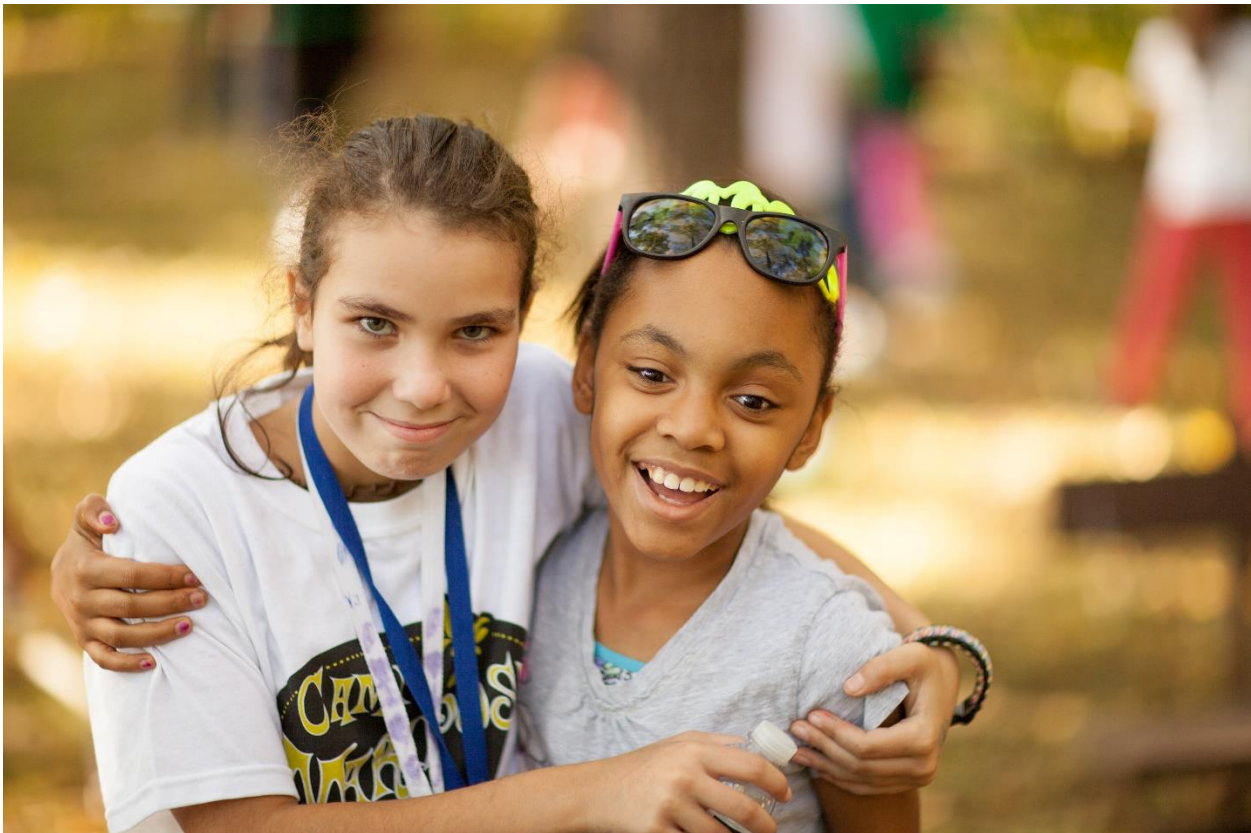
Peer-bonding and reducing feelings of isolation, fear, guilt, and loneliness are very important elements of the camp weekend.